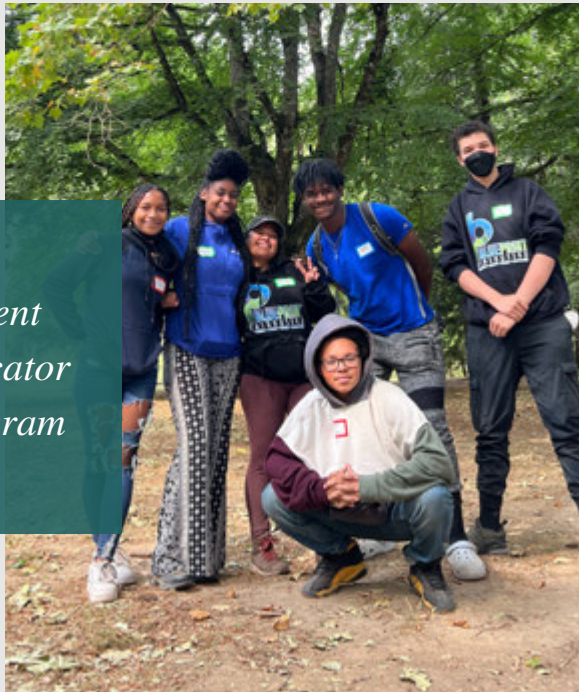
Student Educator Program

Thank you to our partners: Blueprint Foundation, Latino Network, and the Rise to Teach program at PCC/PSU for helping to coordinate, support, and advocate for participating Student Educators.